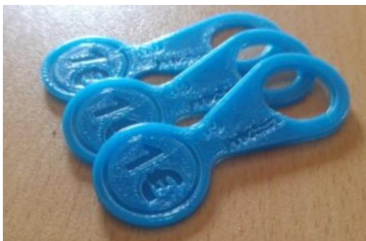
Chip for shopping venture