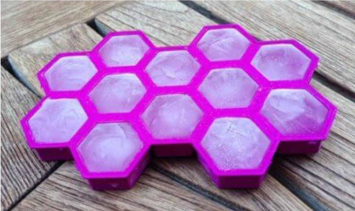
Ice cube mold